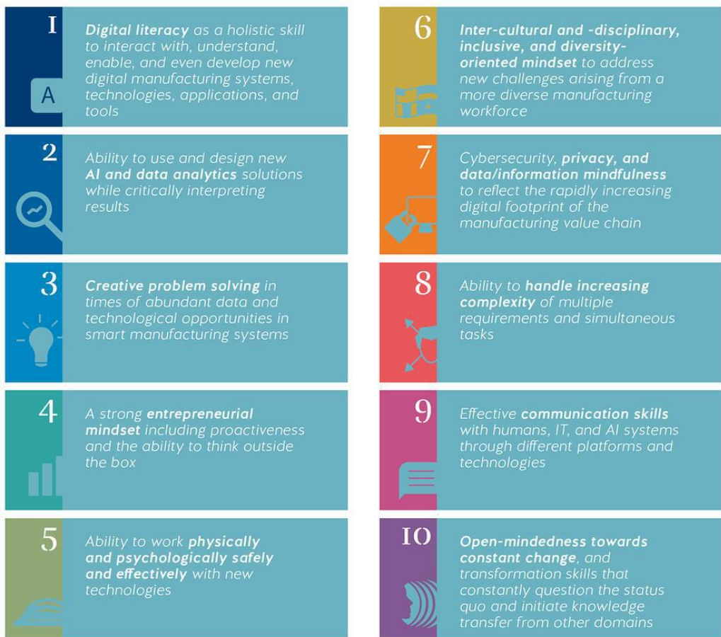
Figure 5. World Manufacturing Forum's top ten skills for the future of manufacturing

While research and innovation are key engines of productivity and competitiveness, economies and companies can also benefit by importing and adopting innovations produced elsewhere. The technology diffusion depends primarily on absorption capacity, which can be built via internal investment in skills and human capital. Companies could, and should, play a more important role in the education and training of the workforce as they have the expertise, knowledge and most direct link to technology. They know which skills are missing, and which will be required in the future. Workers should meanwhile be encouraged to participate in the design of trainings, to make sure trainings are relevant and adapted to their audience.