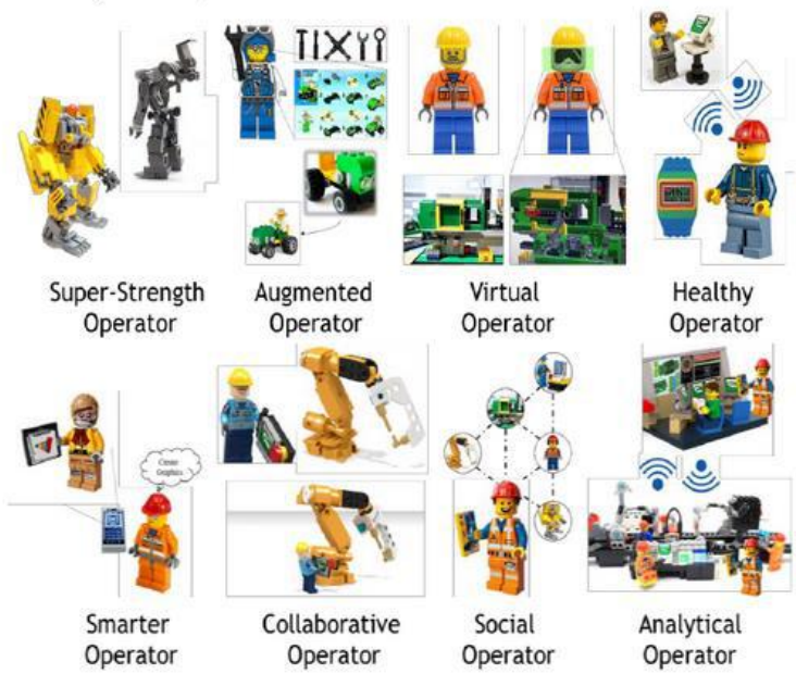
Figure 3. Operator 4.0 typology.

assistant), the Collaborative Operator (operator + collaborative robot), the Social Operator (operator + social networks), and the Analytical Operator (operator + Big Data analytics) xii . With this approach, humans remain at the centre of the production process, and technology maximises the benefits for both the company and the worker.