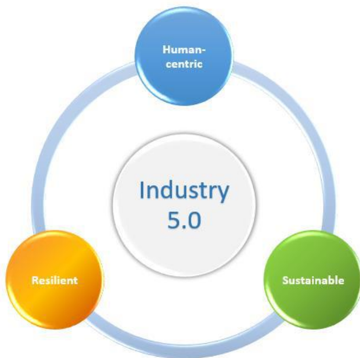
Figure 2. Industry 5.0.

A purely profit-driven approach has become increasingly untenable. In a globalised world, a narrow focus on profit fails to account correctly for environmental and societal costs and benefits. For industry to become the provider of true prosperity, the definition of its true purpose must include social, environmental and societal considerations. This includes responsible innovation, not only or primarily aimed at increasing cost-efficiency or maximising profit, but also at increasing prosperity for all involved: investors, workers, consumers, society, and the environment.